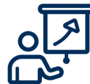
Fully Qualified Teacher